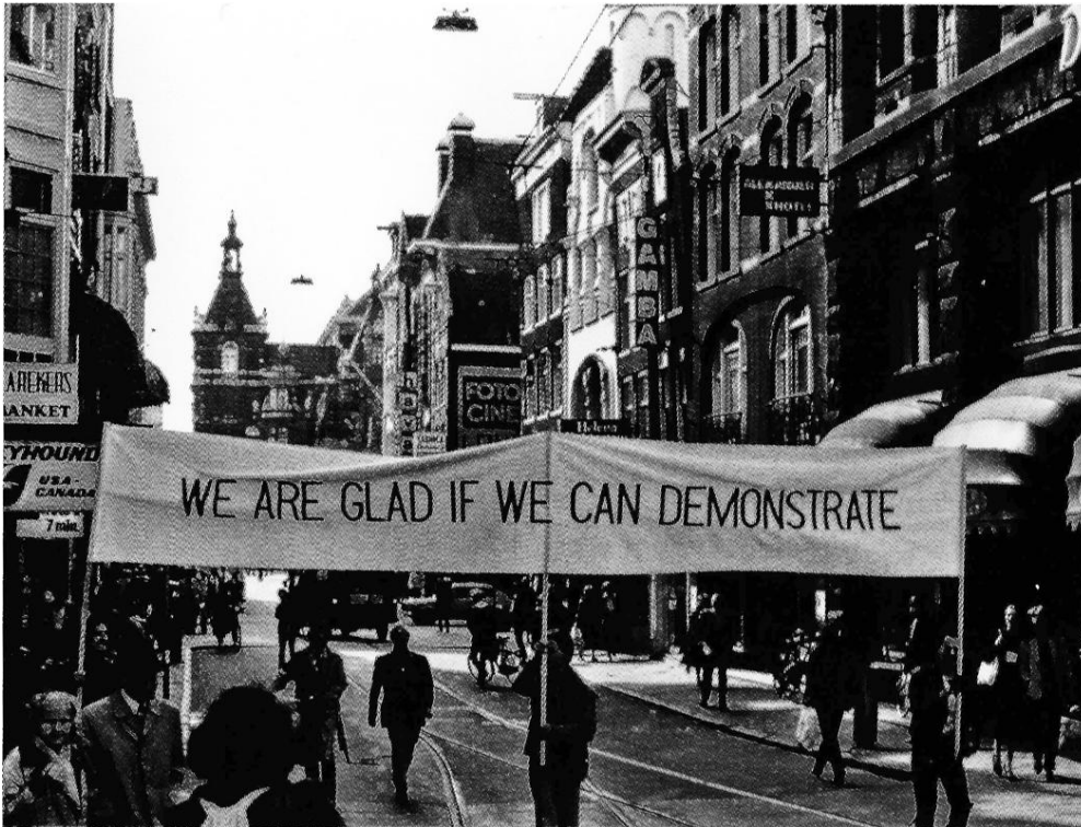
Endre Tót: Gladness Demonstration, Amsterdam, 1979.

Endre Tót —a cult figure of the Hungarian neo-avant-garde—with a group of protesters will march in the streets of Budapest to showcase the joy of demonstration itself, an act he has been practicing since the seventies, when he left Hungary for Germany. Today everyone has the right to protest when in distress, but hardly anyone takes to the streets out of sheer joy. Although it might be advisable to demonstrate in times fraught with difficulties, on the brink of a crisis, we can still rejoice, also as a community. An act of joy and its public demonstration is a snub par excellence to an oppressive political system.