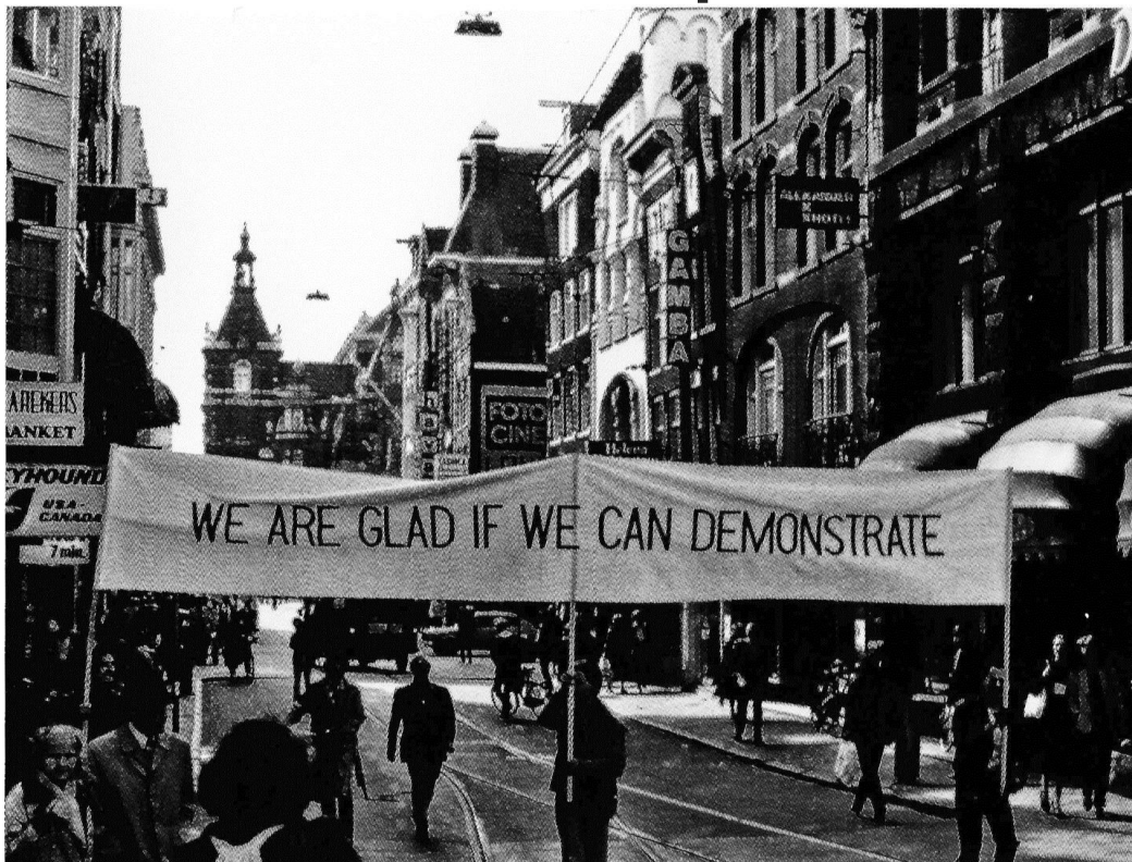
Endre Tót, Gladness Demonstration , Amsterdam, 1979.

OFF-Biennale Budapest Gaudiopolis 2017 – The City of Joy September 29–November 5, 2017